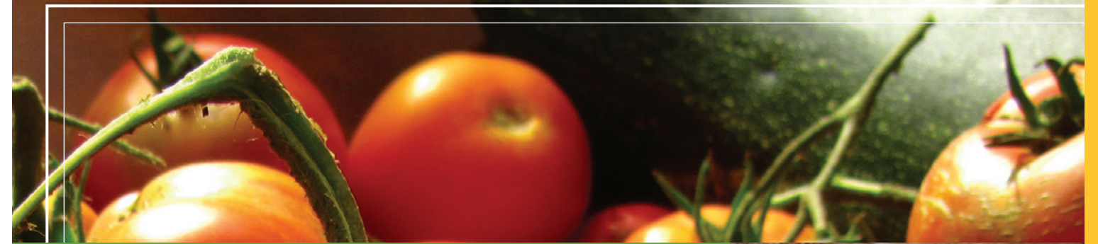
Willow Springs Elementary, Wake County Public Schools, North Carolina