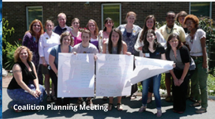
Coalition Planning Meeting

The Farm to School Coalition of NC began in 2011, with several planning meetings conducted in 2012 (April 23, June 26, and September 10, 2012). The coalition identified many existing areas of success in farm to school programming throughout North Carolina, including: