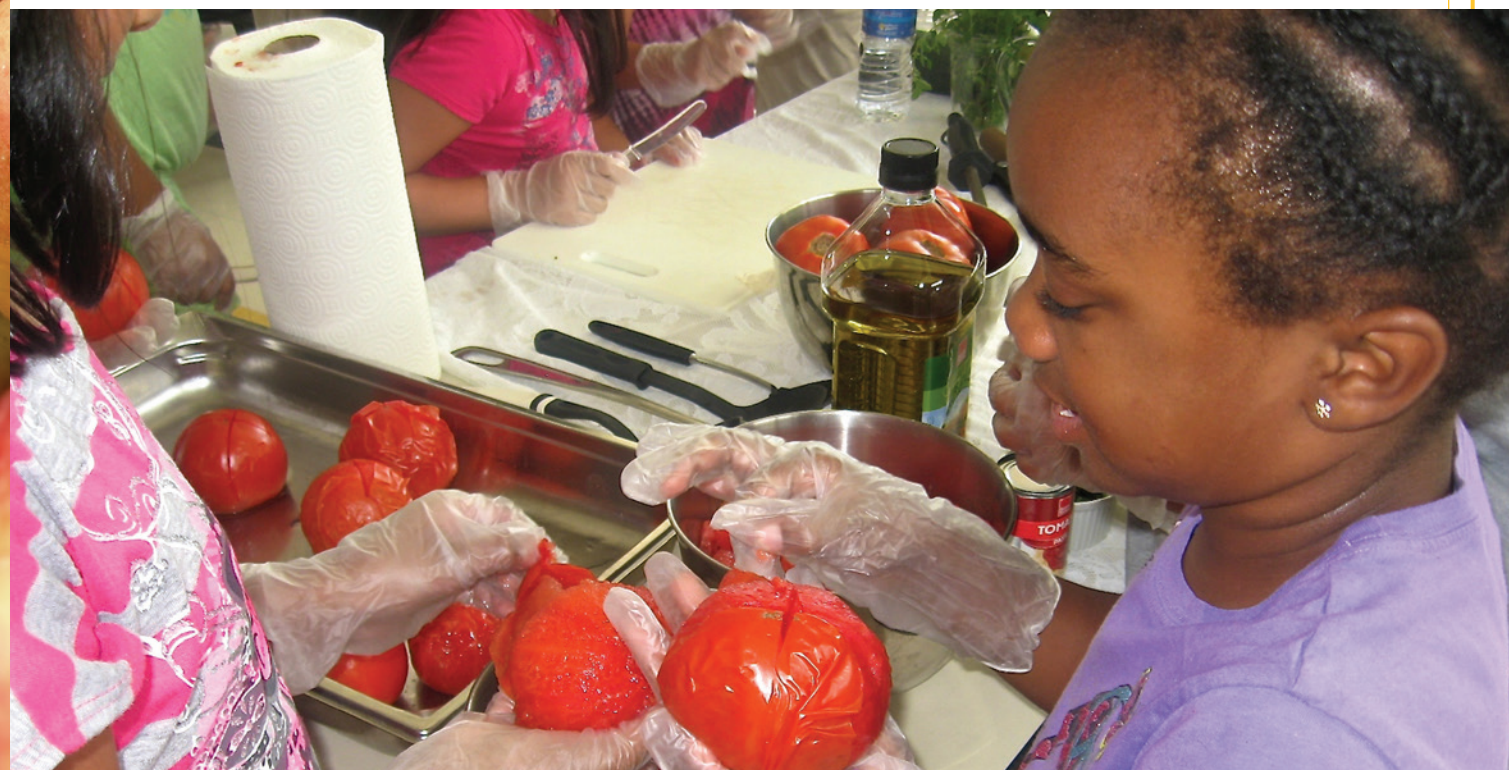
Charlotte-Mecklenburg Schools, North Carolina