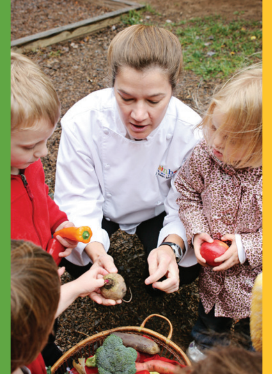
Verner Center for Early Learning, Asheville, NC

The Farm to School Coalition of NC seeks to expand and strengthen farm to school initiatives across the state through outreach, network development, and capacity building.