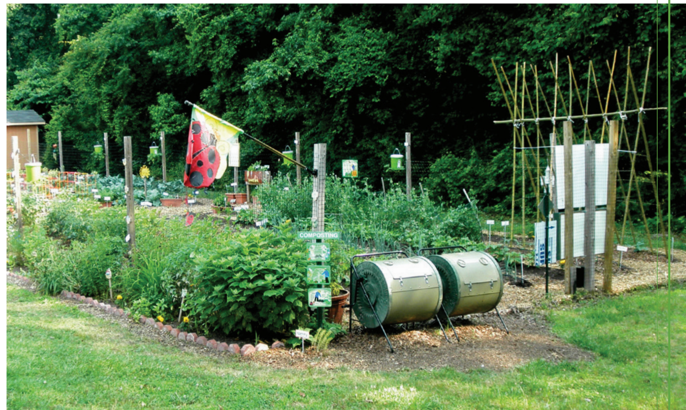
FARM to SCHOOL COALITION OF NC

The Farm to School Coalition of North Carolina (F2SCNC) brings together a dedicated group of farm to school stakeholders that will collaborate to expand and strengthen farm to school initiatives focused on K-12 students across the state.