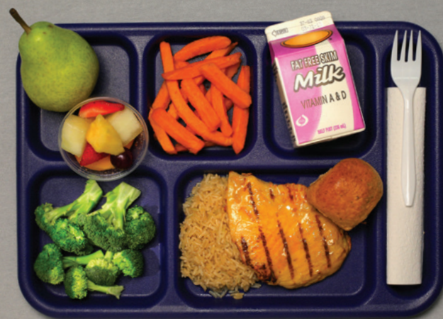
North Carolina High School Lunch, Fuel Up to Win the Race to the Top