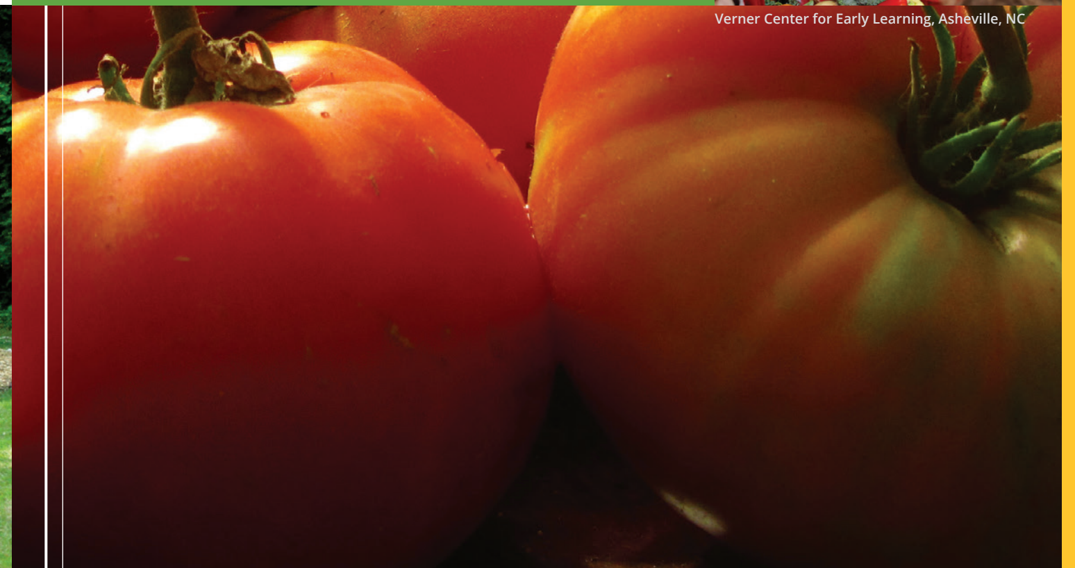
FARM to SCHOOL COALITION OF NC